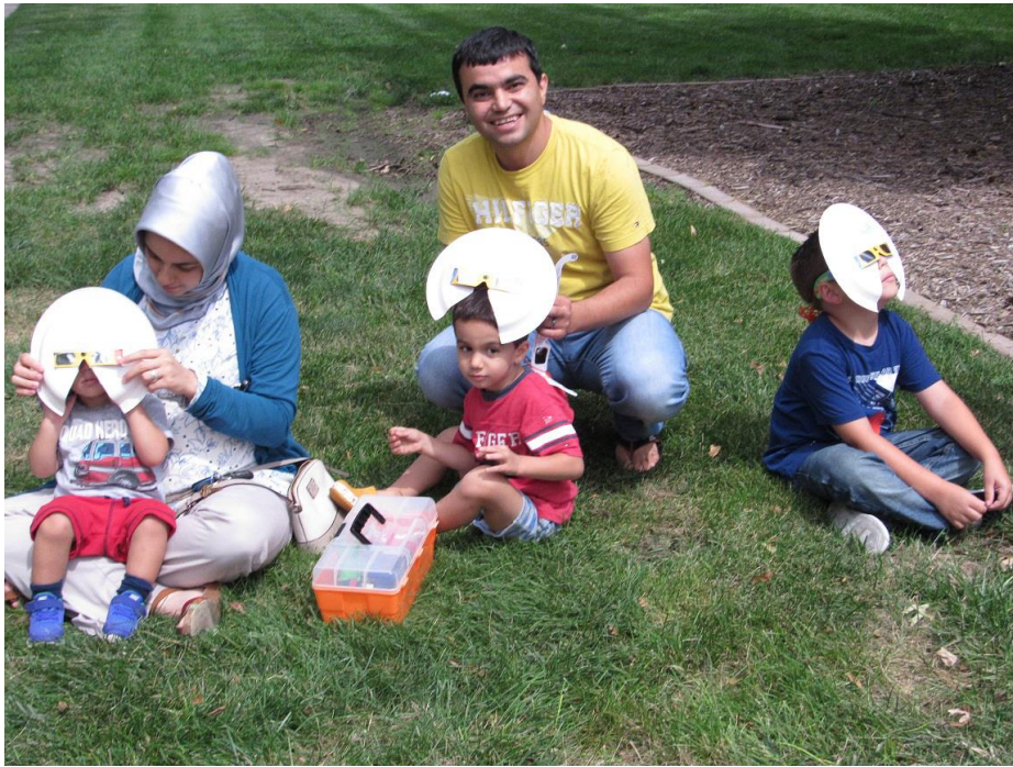
Keene Memorial Library, Fremont, Nebraska

Extrapolating from the survey responses, the project staff estimated that the 7,100 participating libraries held some 35,000 eclipse-education events, and that these events reached about 1.75 million people in their home communities. With each pair of glasses being shared by families, groups, or at library locations, we estimate some 6 million people were able to observe the eclipse safely thanks to our efforts.