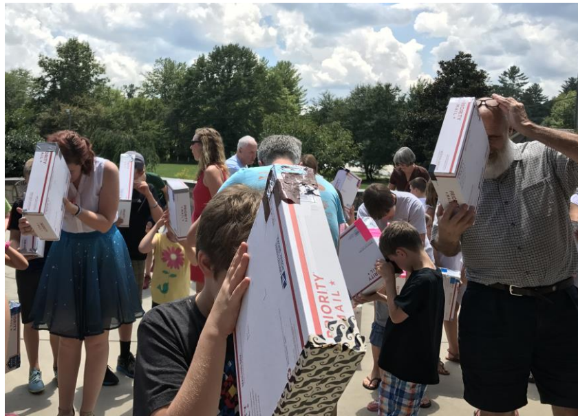
Transylvania County Library, Brevard, North Carolina

“[I did] a training exercise with the librarians at the Manhattan Library in Kansas. I went over several ideas of how we can present to their public about the eclipse.... I gave them handouts and posters for their display...I brought many props [and activities] about moon phases, eclipses, the Sun, and [even] the Pocket Solar System activity...They loved everything I showed them... We even discussed extending our partnership for future outreach programs with their public.” – Amateur Astronomer (Member of one of the Night Sky Network Clubs)