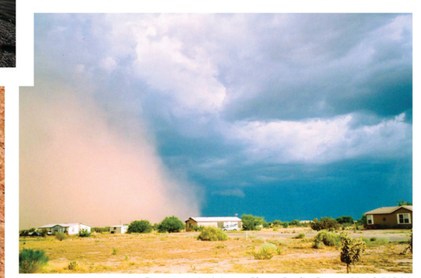
Dust storm in Arizona

The global environment changes – and is changed by – our community's local environment