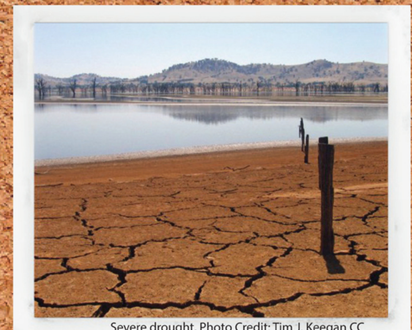
Severe drought